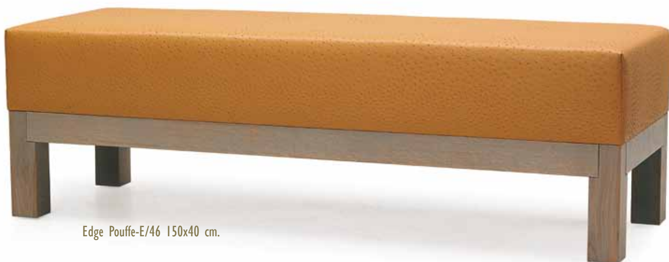
Edge Pouffe-E/46 150x40 cm.