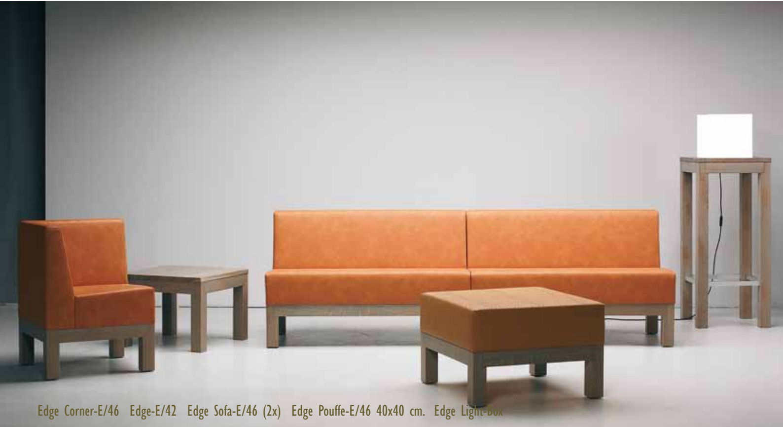
Edge Corner-E/46 Edge-E/42 Edge Sofa-E/46 (2x) Edge Pouffe-E/46 40x40 cm. Edge Light-Box