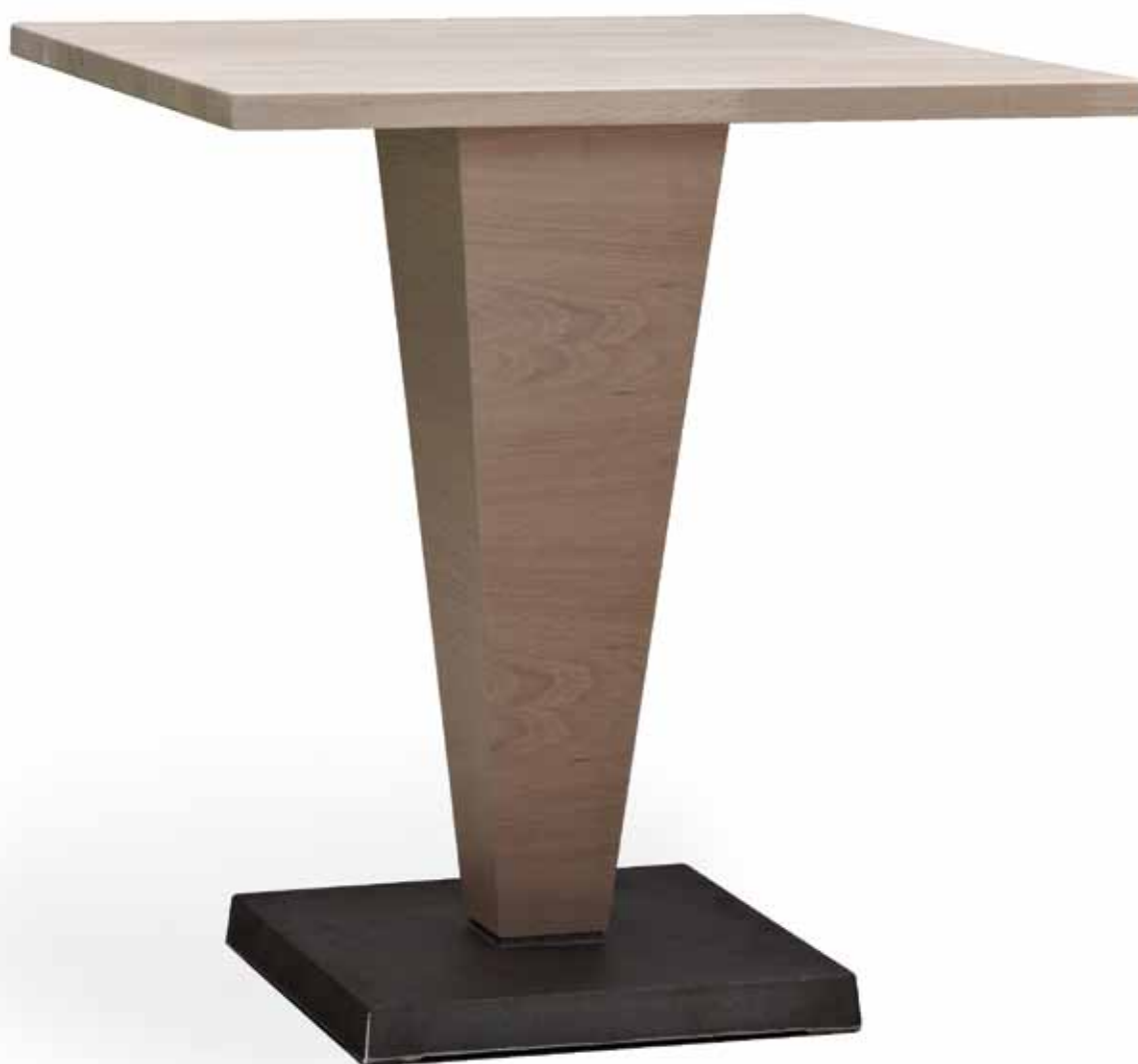
Table with 1 or 2 columns made of oak veneer with a recycled cast iron base of 40x40 cm.

Pyramid-E 40x40/71 tabletop: Typ-500 70x70 cm.