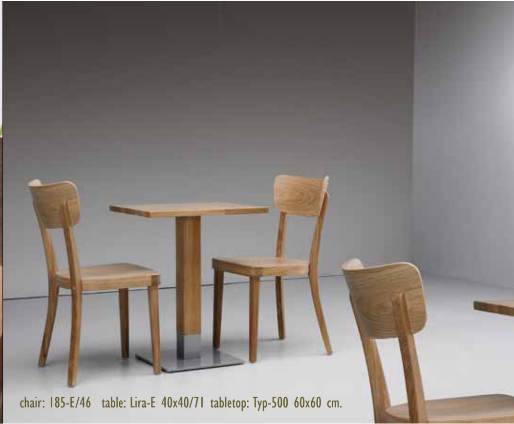
chair: 185-E/46 table: Lira-E 40x40/71 tabletop: Typ-500 60x60 cm.