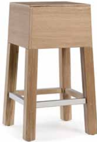
Peak-E/62 seat height 62 cm.