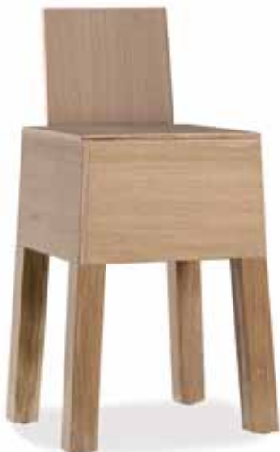
Peak-E/46+R32 seat height 46 cm.