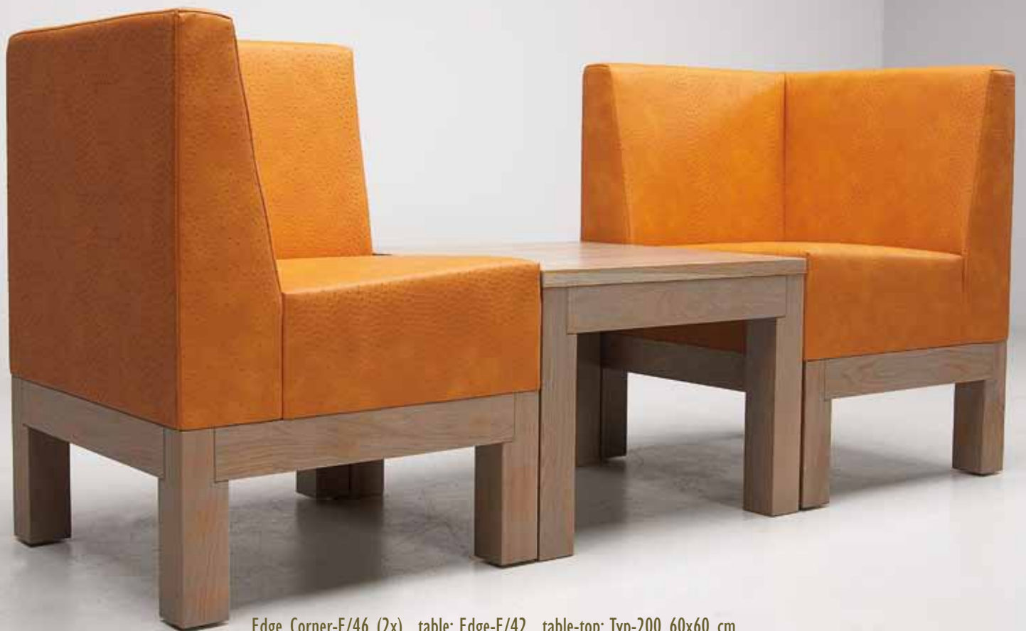
Edge Corner-E/46 (2x) table: Edge-E/42 table-top: Typ-200 60x60 cm.