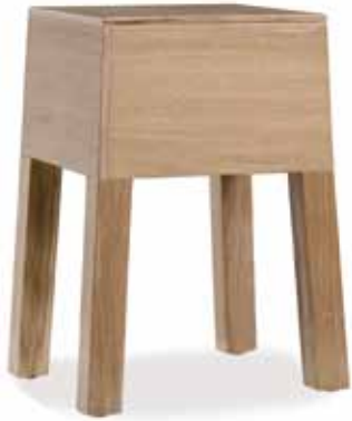
Peak-E/46 seat height 46 cm.