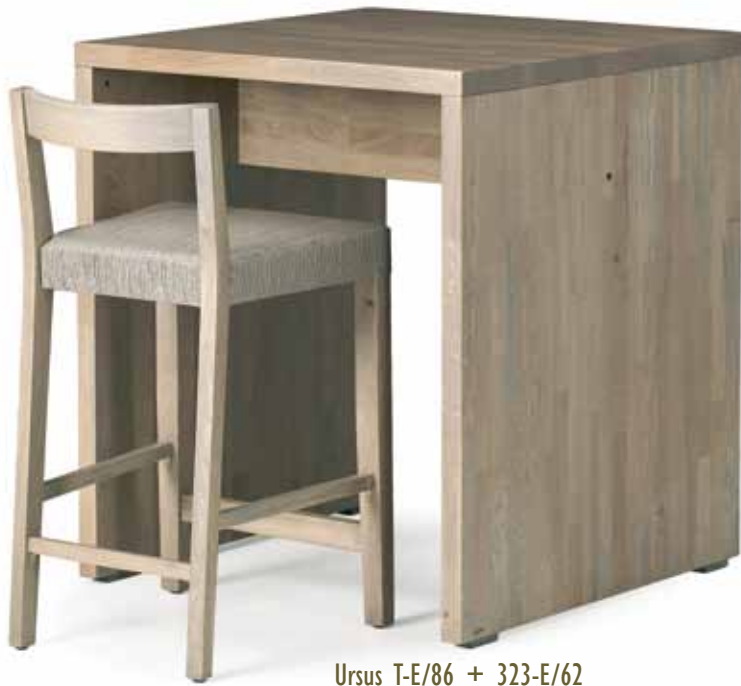
Ursus T-E/86 + 323-E/62