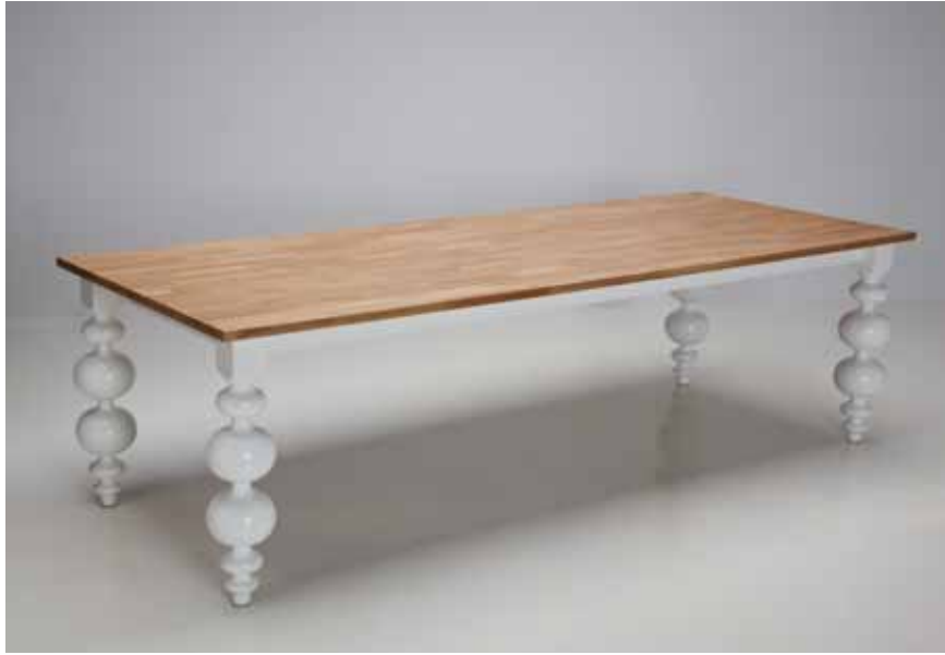
Table base VG table

Our advice would be a minimum of 90 cm. width, so a chair can be placed at the table head.