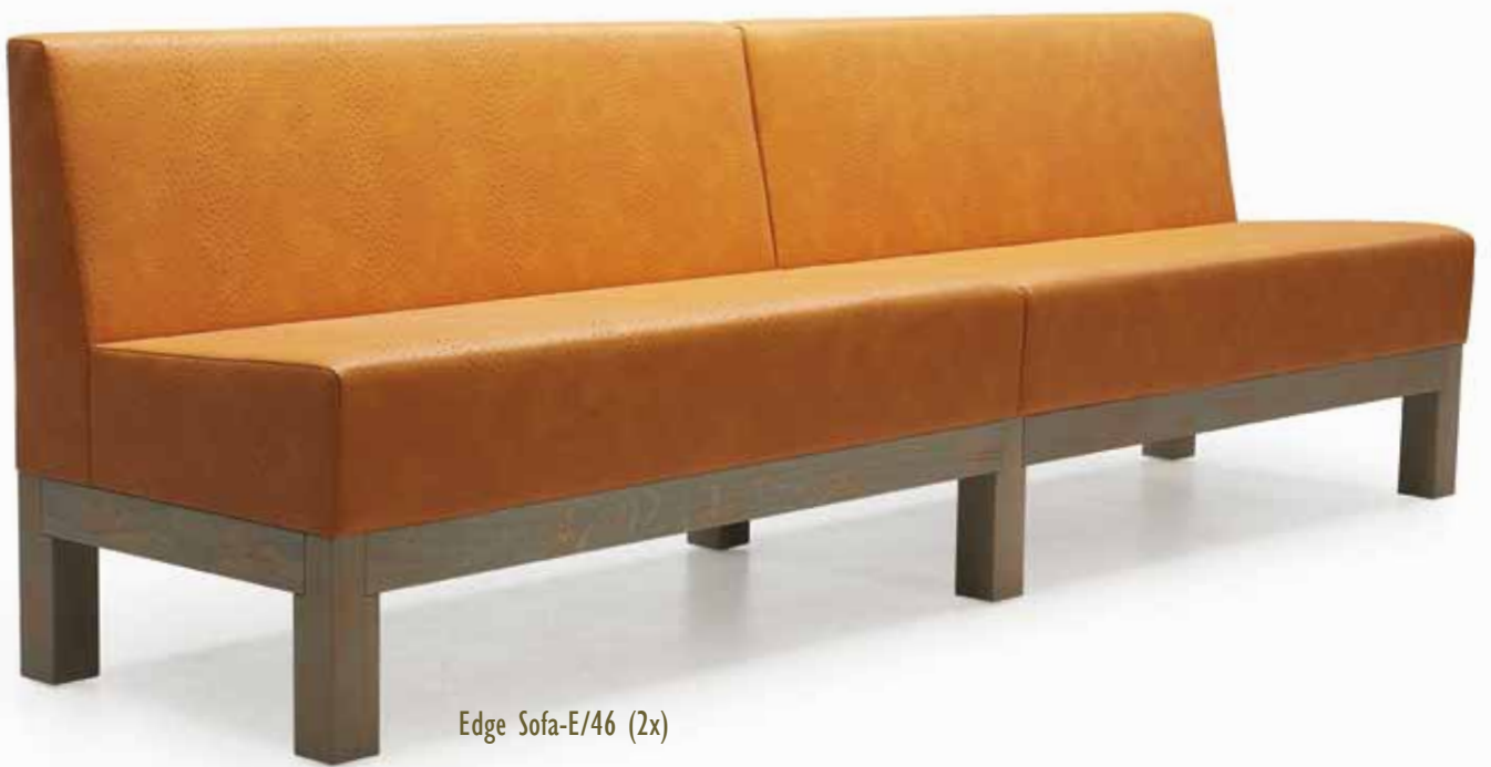
Edge Sofa-E/46 (2x)