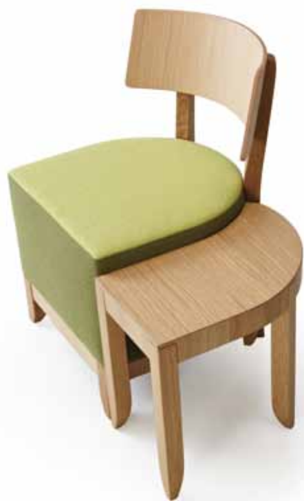
Aruji-E/46 + Kuji-E