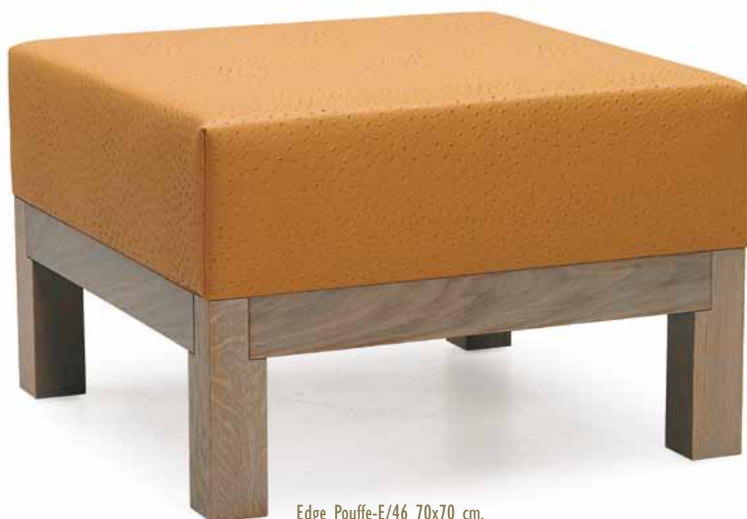
Edge Pouffe-E/46 70x70 cm.

The Edge concept is based on a simple design idea, a construction detail, that you will find back in all models. It offers next to solid oak also certain models in beechwood.