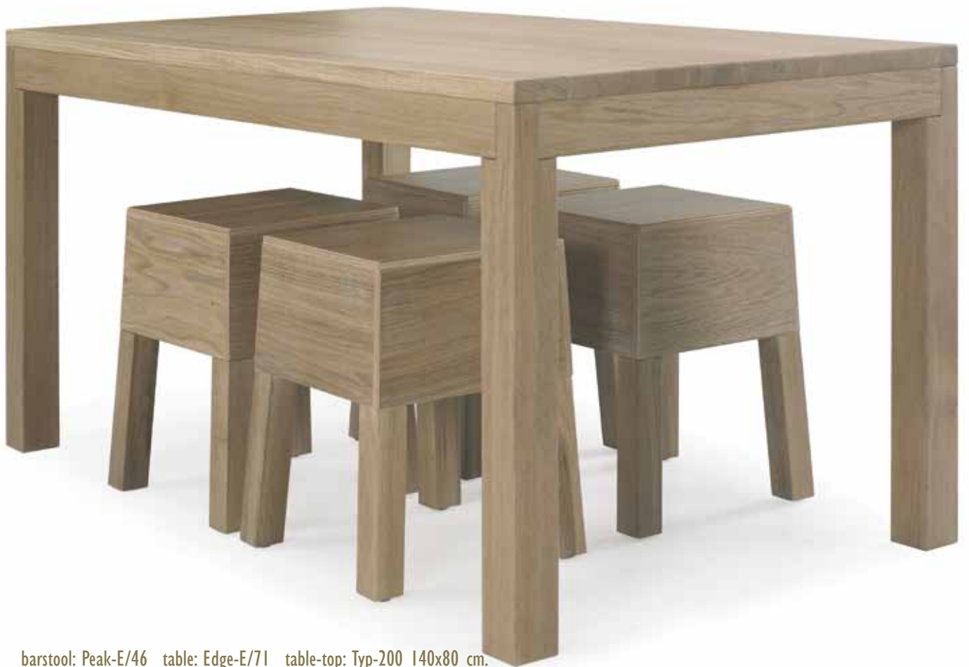
barstool: Peak-E/46 table: Edge-E/71 table-top: Typ-200 140x80 cm.

An additional and thin upholstered seat panel gives some extra comfort and offers the option to make an accentuating colour statement.