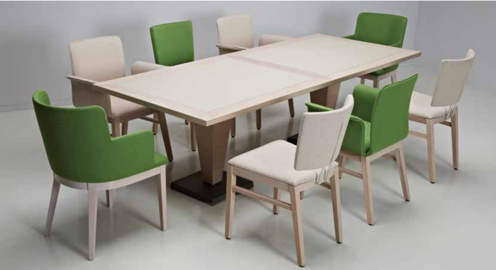
table: Pyramid-E 40x40/71 (2x) tabletop: Typ-24 240x100 cm. inlay Walton 169 greige chairs: Milo/46, 323-E/46 and Myra-E/46