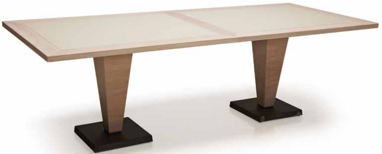
Pyramid-E 40x40/71 (2x) tabletop: Typ-24 240x100 cm. inlay Walton 169 greige