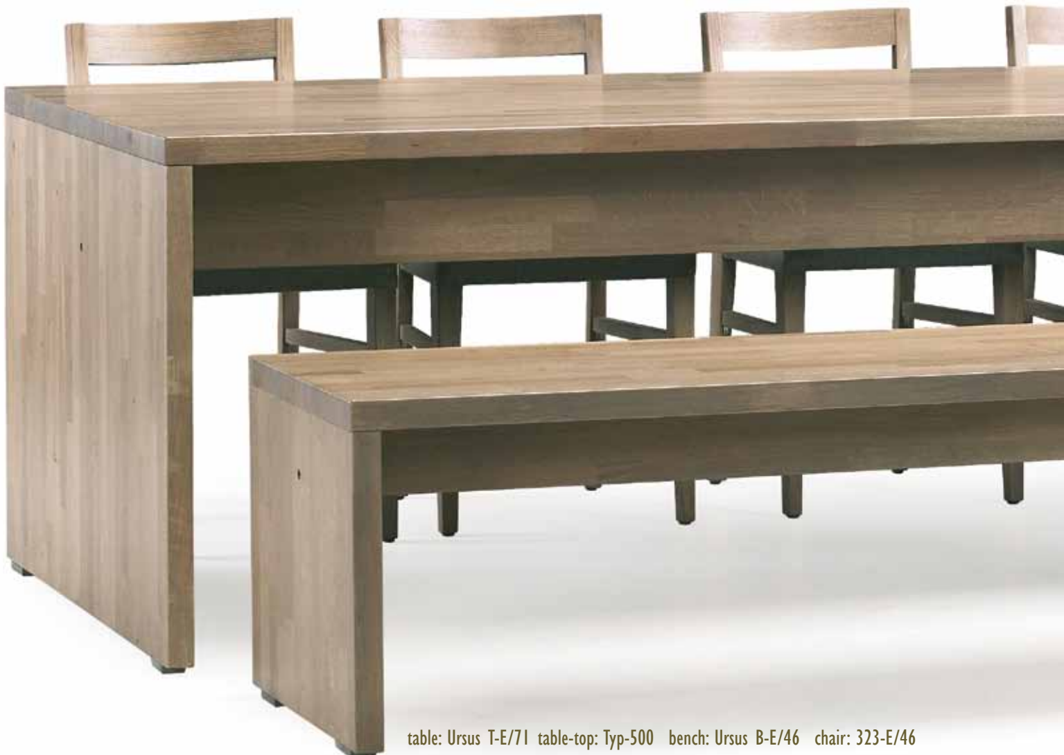
table: Ursus T-E/71 table-top: Typ-500 bench: Ursus B-E/46 chair: 323-E/46

Our Ursus range offers matching benches and tables in various lengths and heights.