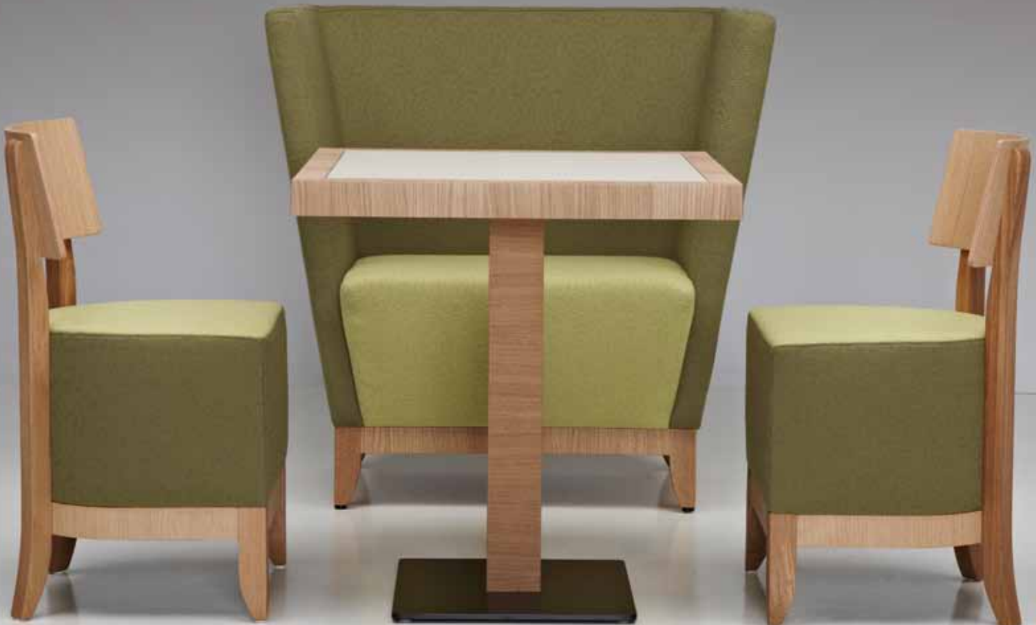
chair: Chikara-E/46 table: KI-E 40x40/71 table-top: Typ-24 inlay Walton 169 greige bench: Fune-E/46-70