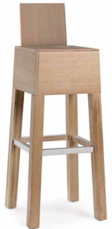
Peak-E/80+R32 seat height 80 cm.