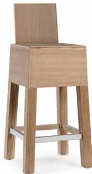
Peak-E/62+R32 seat height 62 cm.