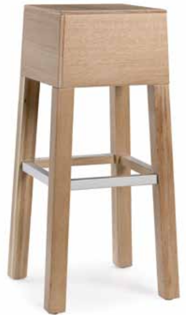
Peak-E/80 seat height 80 cm.