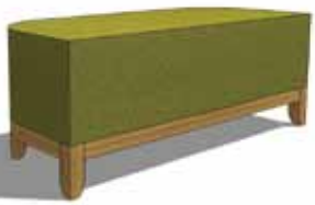
Tsuki-E/46-120 Pouffe, 120 cm. width. Seat height 46 cm.

Bench Fune also available in 155 cm. width (Fune-E/46-155)