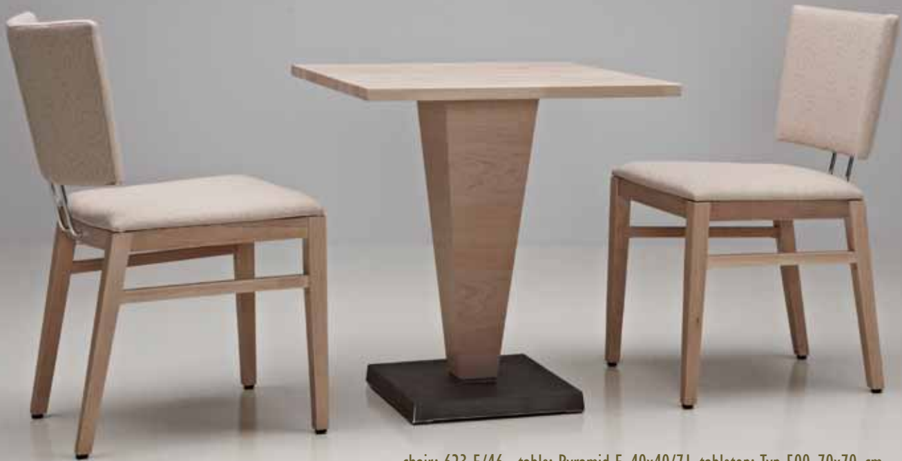
chair: 623-E/46 table: Pyramid-E 40x40/71 tabletop: Typ-500 70x70 cm.

Oak, a characteristic wood, is the basic material for all these models.